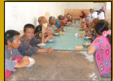
Too less food to live from