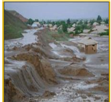
Mudstreams over 3 villages near the boarder of Afghanistan